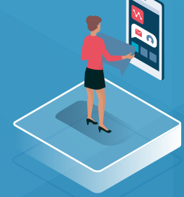
TECHNICAL SESSIONS & SUPPORT REVIEW