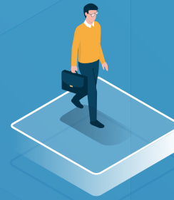
APPSANYWHERE DEMO & PRODUCT ROADMAP