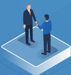
EXECUTIVE STAKEHOLDER MEETING