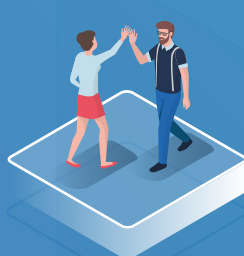
IN-PERSON CATCH UP