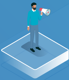
MARKETING & COMMUNICATIONS PLANNING

Continue to benefit from regular reviews with your dedicated Customer Success Manager to ensure you continually get the most value out of your new AppsAnywhere Cloud platform.