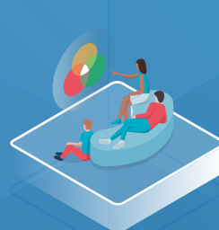
WIDER TEAM MEETING